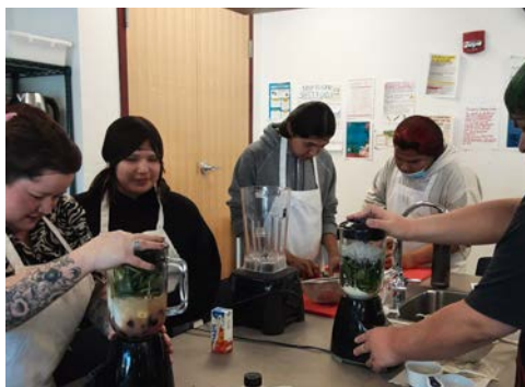
Students assembled all their ingredients and blended them together