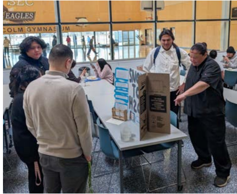
The students also showed off their projects at SEC