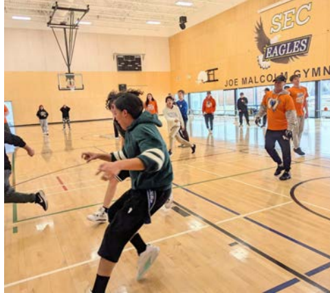
Students training during Blue Bomber Night