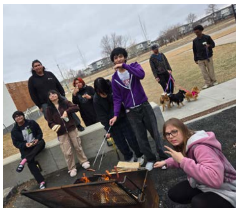
Students (and dogs!) by the fire