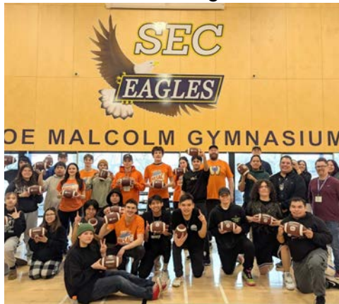
Students enjoyed learning more about football