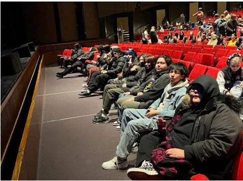
Students sitting front row

The Mental Fitness class had the opportunity to attend the Robb Nash Project concert at the Centennial Concert Hall. The Robb Nash Project is a mixture of rock music performances and inspiration stories about mental health. The whole goal of the concert is to inspire and empower youth through music and storytelling. Students were treated to front row tickets to the concert and received gifts from the band!