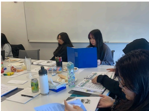
Students studied parenting tips and developmental milestones