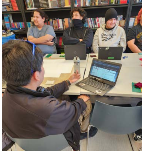
Students have learned to use new tools to make the game more fun!