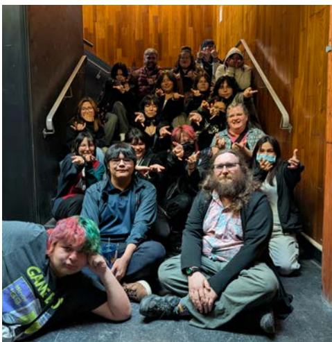
The entire TAFAs crew came to sing and celebrate the end of the term!