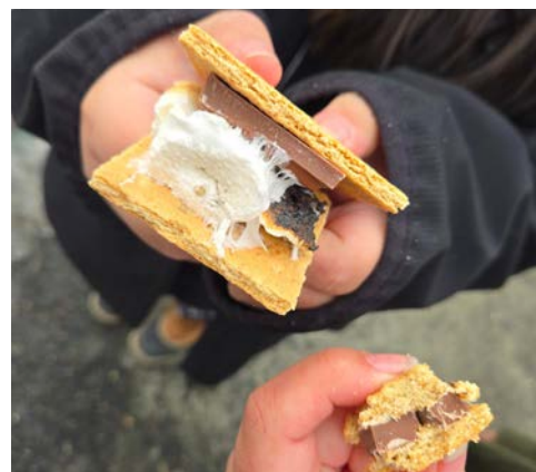
The smores were a big hit!