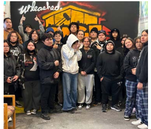
Students at Unleashed Rage Rooms in Niverville