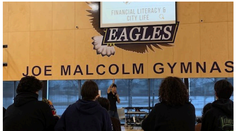
Students learned a variety of real world lessons from someone with experience being where they are