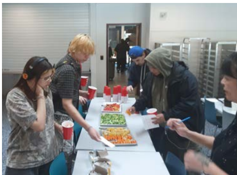
Students and staff enjoyed the hydration station!