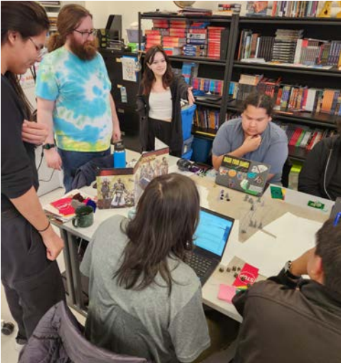
Everyone gathers for a tense moment