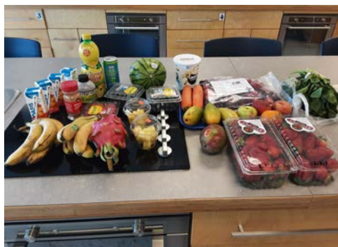
Students had a wide variety of fruits and veggies to choose from!

In their Science of Nutrition unit, Food and Nutrition students chose smoothie recipes because they are a convenient and nutrient-rich way to increase one's intake of fruits and vegetables. Smoothies provide vitamins, minerals, fibre, and antioxidants, which can support overall health and well-being. They also taste great!