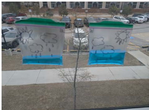
Jen Keno's experiment modelling a miniature water cycle