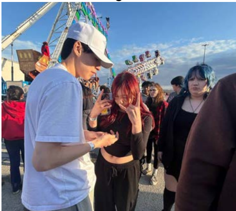
Students enjoying a day out at the fair!