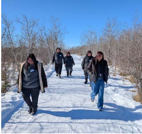
Students enjoyed a clear day on the lake