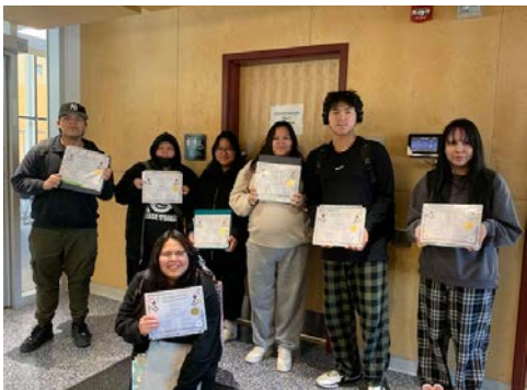
Students received a certificate for participating!

Students jumped into a fun-filled Childcare Program all about little ones ages 0-5! Each week, they explored how tiny tots grow, learn, and play—discovering everything from developmental milestones to safety tips and how to handle those sniffles and sneezes. They rolled up their sleeves to practice diaper-changing and showed off their smarts in lively trivia games. To wrap it all up, each student earned a special certificate and took home a children's book—perfect for sharing story time snuggles with the kiddos in their lives.