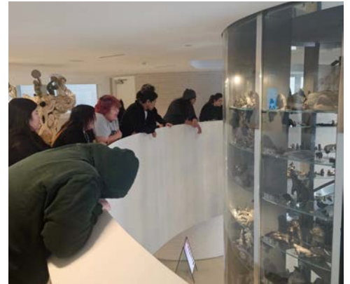
Students looking at the huge collection of Inuit soap carving