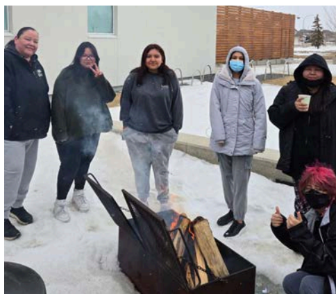
Students enjoying a fire in the snow