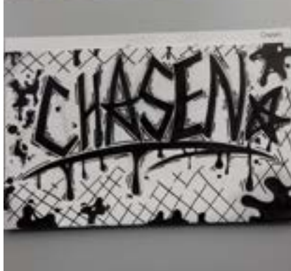
Cherish Wood's tagged art folder