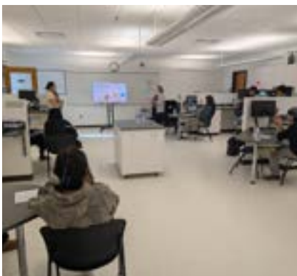
Students at the University of Manitoba

Southeast Collegiate is partnering with the University of Manitoba Rady Faculty of Health Sciences to deliver lab focused, hands-on content to engage students in careers in pharmacy and laboratory science. During their first visit the students participated in ceremony with elders at Ongomiizwin, a space within the faculty that combines medicine and traditional practice with student support to help students during their time at the faculty. Students toured the space and left excited for their next visit.