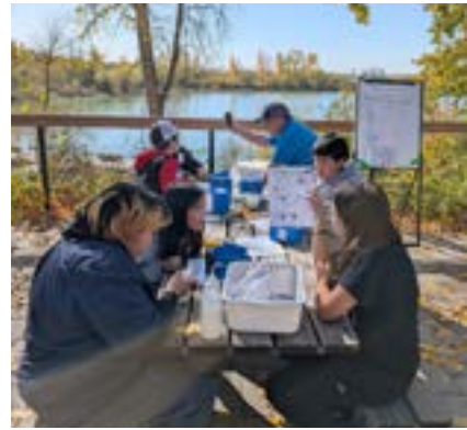
Students evaluating their findings