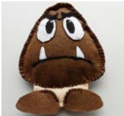
Aubrey Trout's hand stitched pincushion