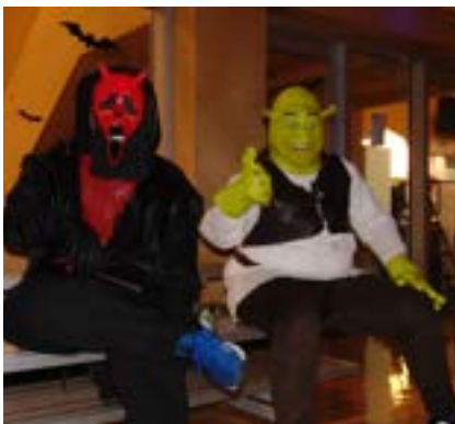
The Scream and Shrek enjoying the Halloween dance