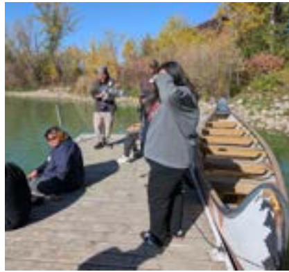
Students gathering water samples from the dock