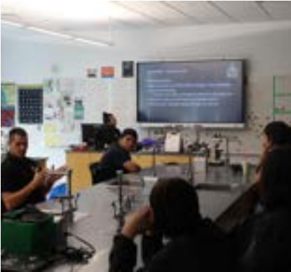
Students learning about the Winnipeg Police Service

Southeast Collegiate recently hosted their annual Career Fair, giving students the chance to explore future education and job opportunities. Students attended presentations from local businesses and organizations and also spent time in the gym visiting booths, speaking directly with employers and gathering information. It was a great opportunity for students to connect, learn, and plan for their futures!