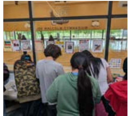
Students excited to explore all the options