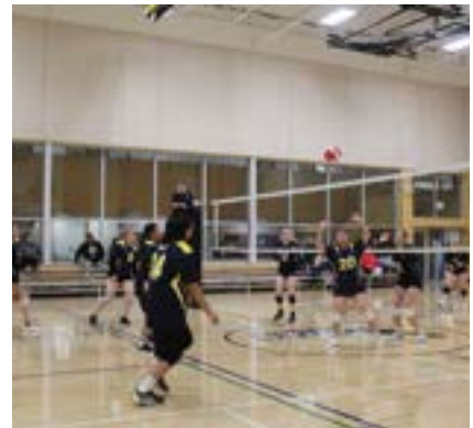
Our girls showing their skills on the court