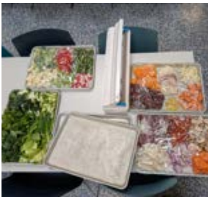
So many different options for the students to try

Students at Southeast Collegiate had a fun and interactive time playing Vegetable Bingo during their digestion unit. The activity helped students learn about how different vegetables are digested and the nutrients they provide.