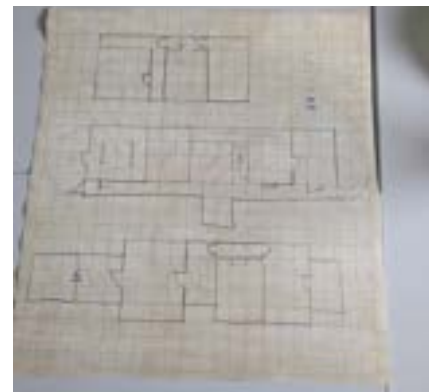
The adventure comes to life on the board