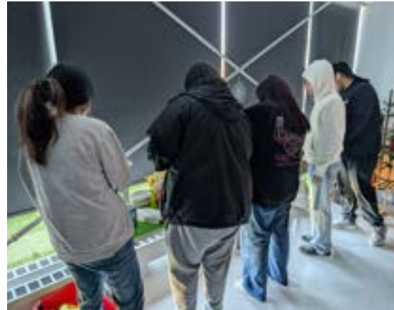
Students lined up for snacks