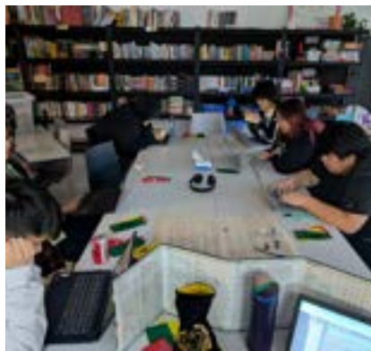
Students dive into an adventure, creating characters and solving challenges together