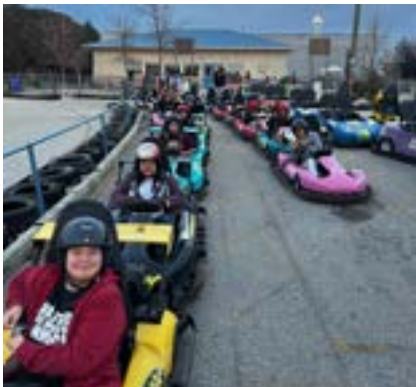
Students ready to race at Thunder Rapids!