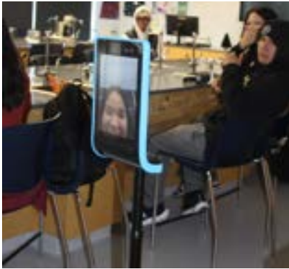
Students using robots in the classroom

Southeast Collegiate proudly hosted the GOOSE Conference – Growing Our Own Specialists through Education, inspiring students to explore careers in rehabilitation sciences. The event welcomed students and representatives from Fisher River, Opaskwayak Cree Nation, Norway House Cree Nation, Cross Lake, Berens River, Black River, St. Theresa Point, and Mathias Colomb Cree Nation. The conference encouraged youth to become future health specialists and bring vital services back to their communities.