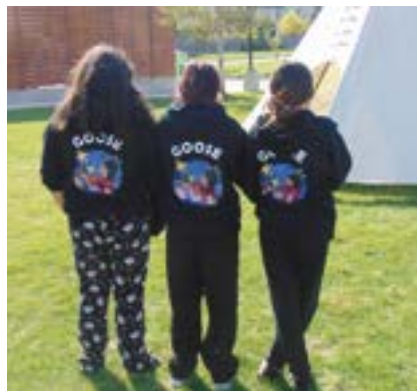
Students showing off their GOOSE hoodies