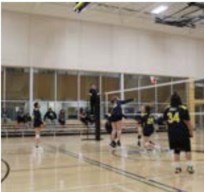
Bump, set, spike!

The Southeast Collegiate girls' volleyball team has been working hard this season and showing great teamwork. They have been doing really well in matches. We're proud of their effort, sportsmanship, and school spirit!