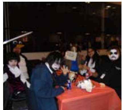
Students dressed up at the Halloween Dance