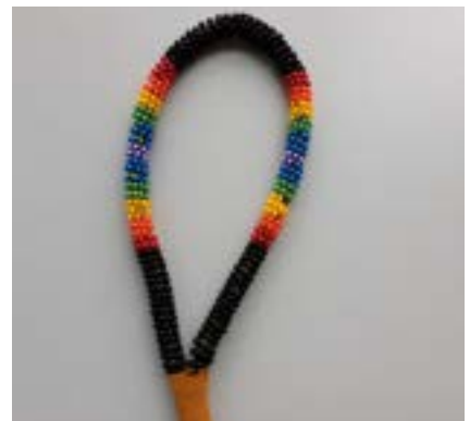
Beautiful lanyard beaded by Jamie Byron