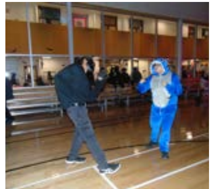
Students dancing in their costumes