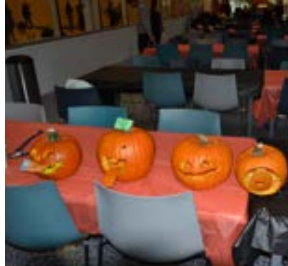
Pumpkins students created