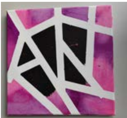
Abstract art piece created by Trent Kanabee