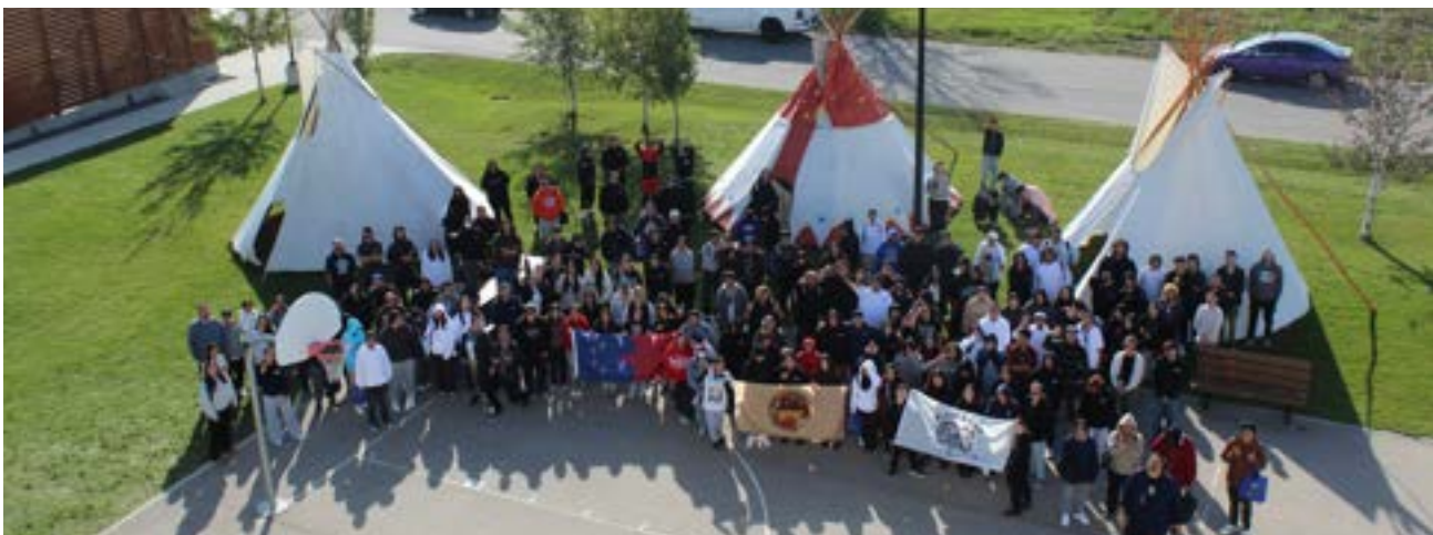
Communities from across Manitoba gathered together for the GOOSE Conference at Southeast Collegiate!