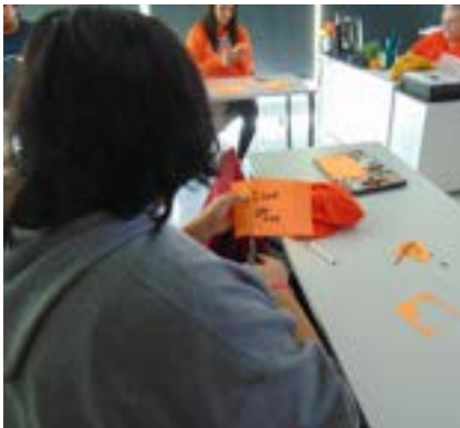
Student creating their message of hope

Students observed the National Day for Truth and Reconciliation by creating messages of hope for the future, learning about the history of Orange Shirt Day, and exploring cultural activities around the school. Students had the options of making bannock, playing traditional games, treaty teachings, beading, and many more activities.