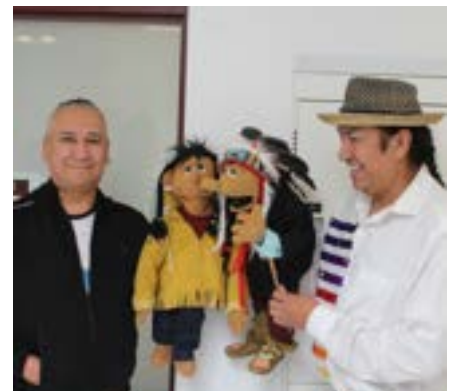
GOOSE Conference emcee Bighetty and Bighetty Puppet Show