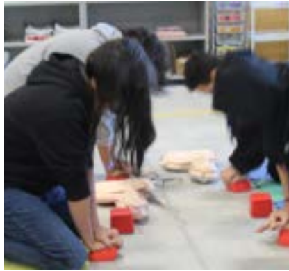
Students practicing CPR