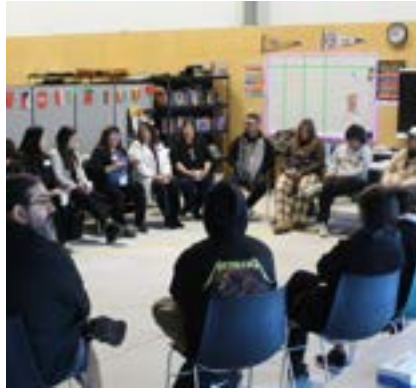
Students gathered in a sharing circle