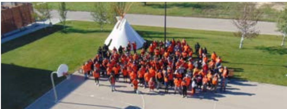
Staff and students supporting TRC Day by wearing orange