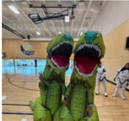
Students dressed as twin dinosaurs