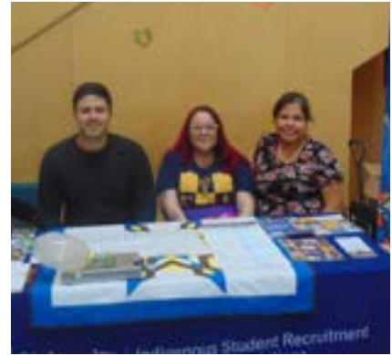
University of Manitoba Indigenous Student Recruitment booth