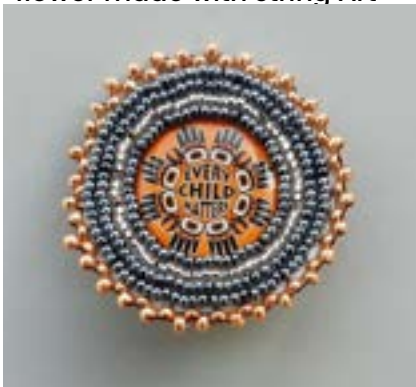
Beaded pin by Madison Flett