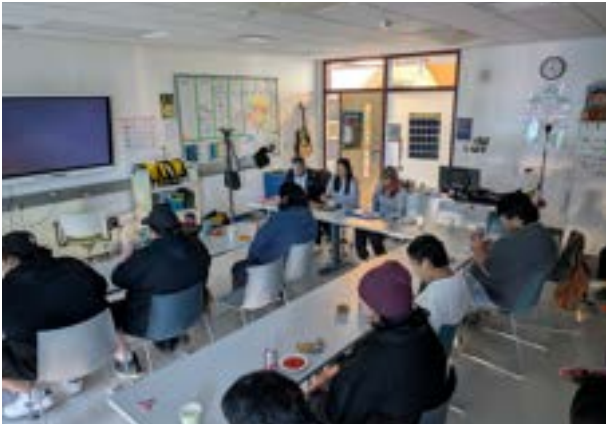
TAFAs movie night always draws a big crowd!

The Alliance for All (TAFAs) held its first after-hours event for the year, a movie night! They provided snacks, drinks, and an inclusive film to build community and provide a safe space. Returning and new members had a great time!